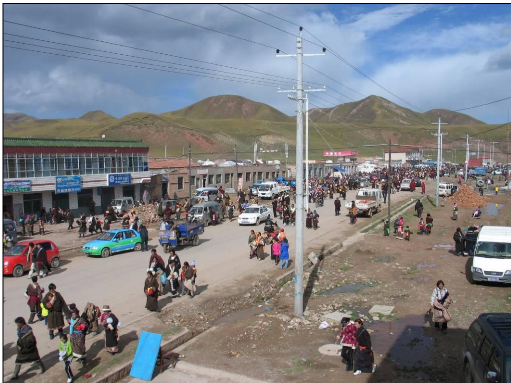
A view of Tovden Town during a festival (where Nick comes from.)