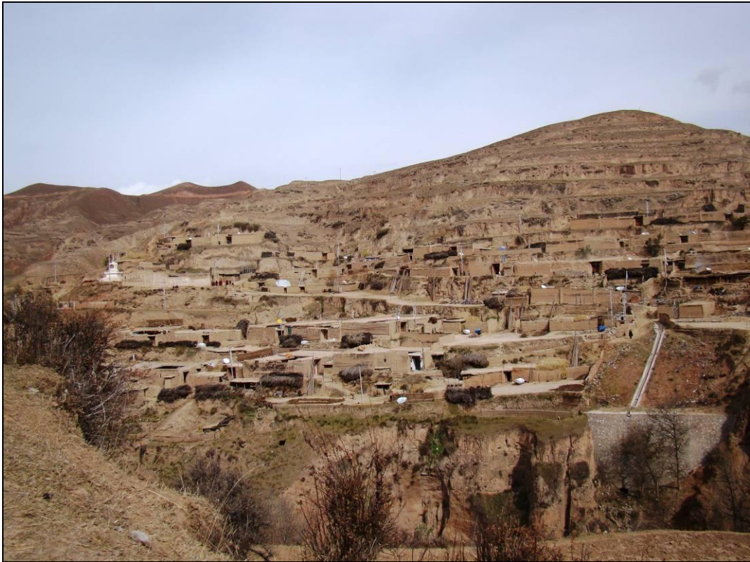
One of the villages in the Shongpong Xi area